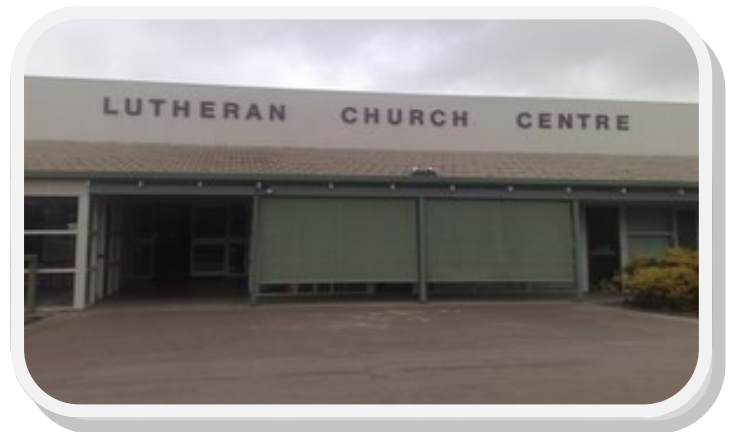
Victor Harbor Lutheran Church Centre